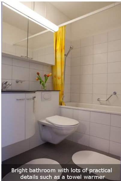
Bright bathroom with lots of practical details such as a towel warmer