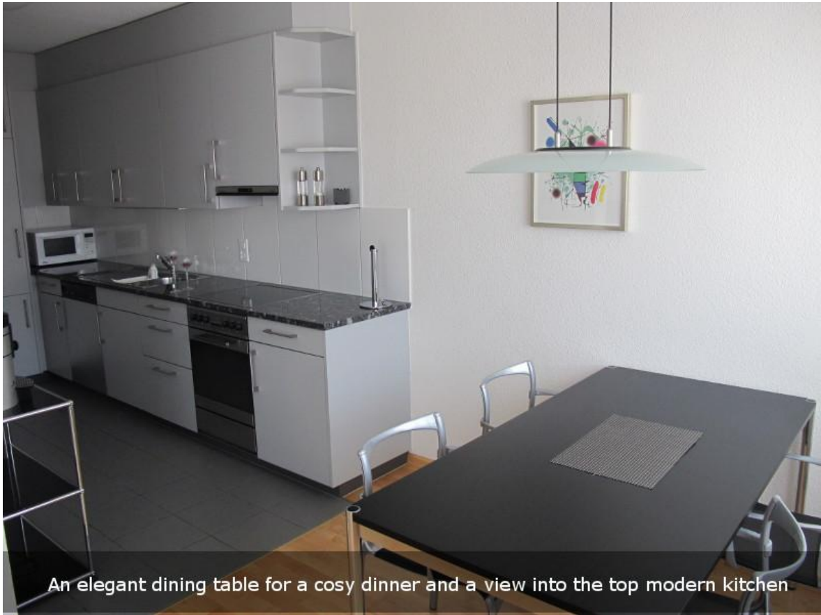
An elegant dining table for a cosy dinner and a view into the top modern kitchen