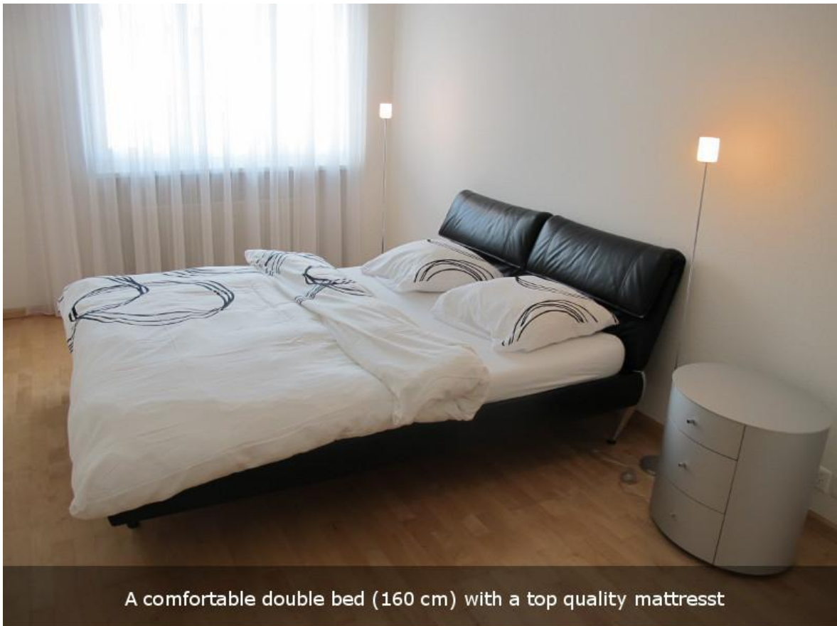
A comfortable double bed (160 cm) with a top quality mattress