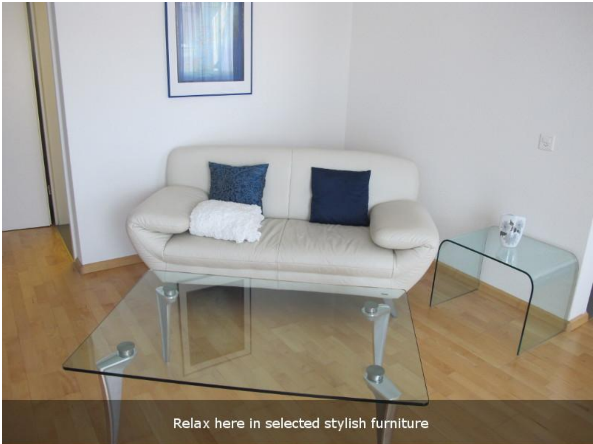
Relax here in selected stylish furniture