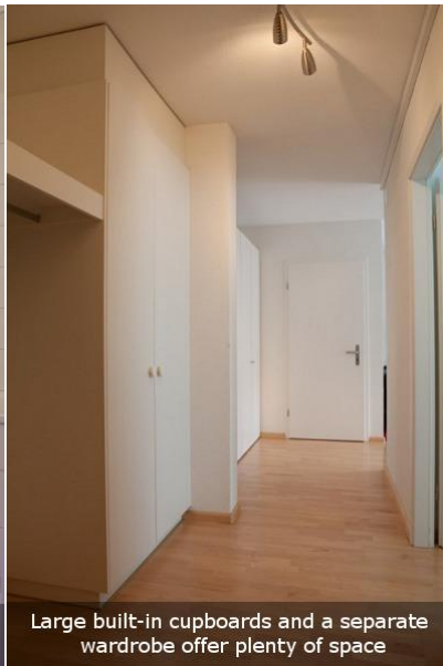
Large built-in cupboards and a separate wardrobe offer plenty of space