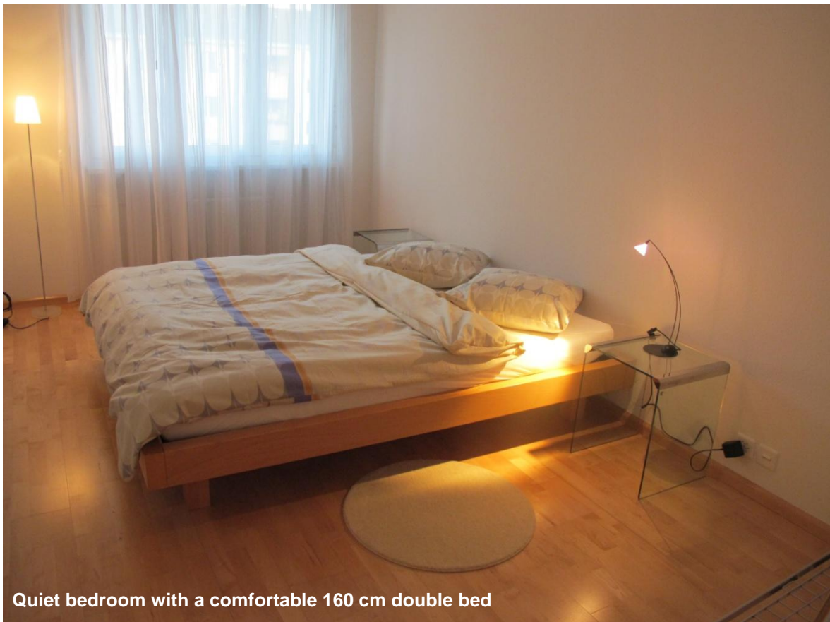
Quiet bedroom with a comfortable 160 cm double bed