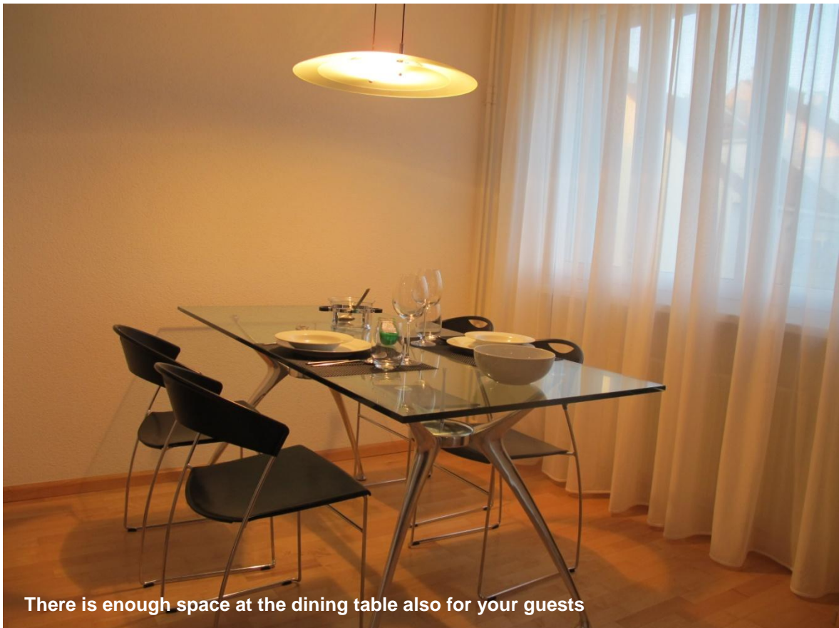
There is enough space at the dining table also for your guests