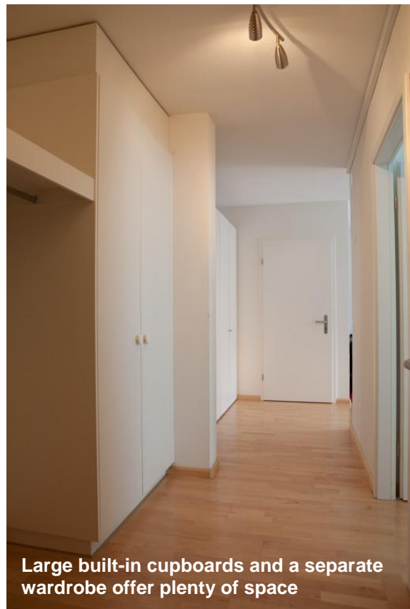
Large built-in cupboards and a separate wardrobe offer plenty of space