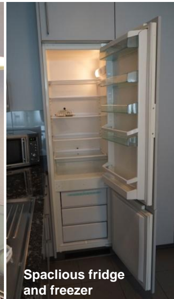
Spacious fridge and freezer