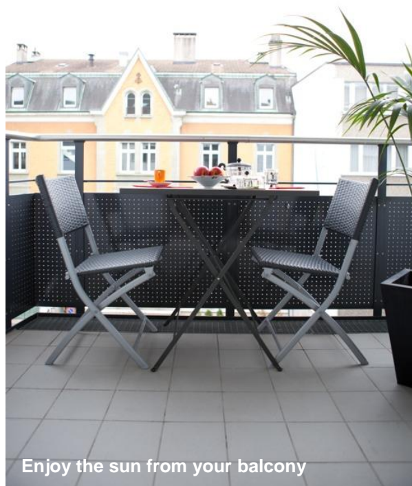
Enjoy the sun from your balcony