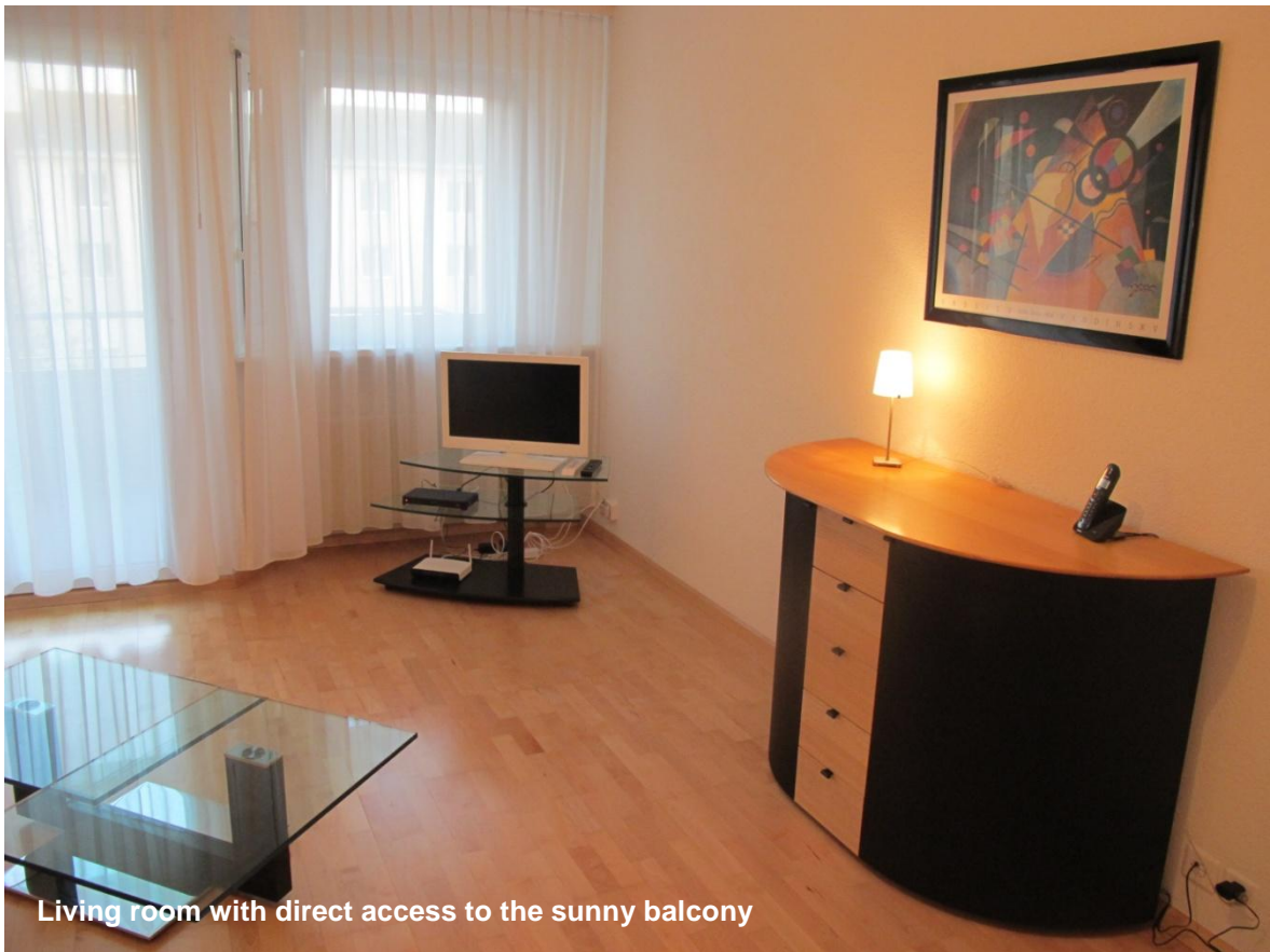
Living room with direct access to the sunny balcony